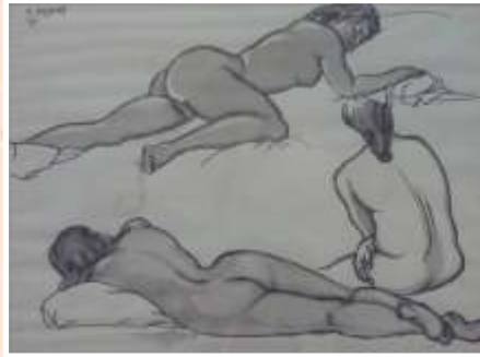
Rudolf Bonnet, 35x48cm, ink on paper, 1965