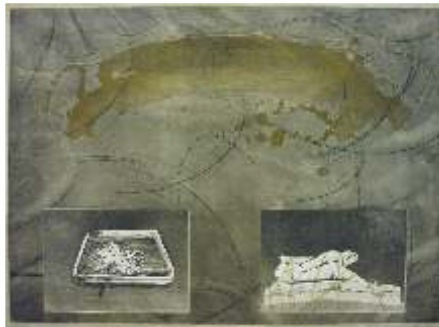
Marck Jurt, Offering #22, Mix Media on wood, 71x100cm, 1997