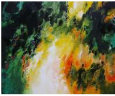
Pieter Deiman, 120x145.5cm, 2008

Pameran Bersama Seniman Ekspatriat 27 Maret - 10 April 2010