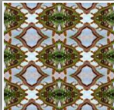
Anja Zwanenburg, Rice paddies and banana trees, 90 x 90 cm, Digital Photo Art on Canvas, 2009