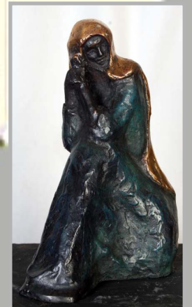
Tineke Vermeer, Waiting for, 22 x 16 x 10cm, bronze, 2010.

Due to, Hanna Artspace in this event will visualize the expression of the expatriate artists of and during their stay in Bali, packed in the exhibition entitled "Bali from Beyond". In addition to present the work that is suitable for collection by the collectors and art lovers, this exhibition is expected will bring new barometer for the national art to produce works with international qualities.