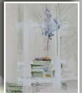
Patrick Okorokoff, Canang # 2, 90x120cm, Acrylic on Canvas, 2009