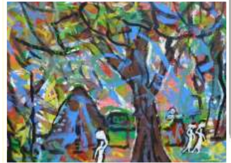
Arie Smitt, The Old Temple, The Old Trees, 50 x 60 cm, Acrylic On Canvas, 2010