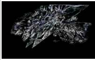
Emilie, Shape Shifters, Digital print on Canvas, 2009