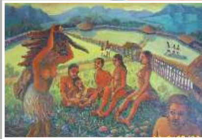
Piet Nuyttens, Coffee Break, 70 x 90 cm, Oil On Canvas.